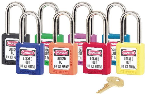
The 0410 range of Zenex Safety Padlocks are a core component of any of Master Lock's general-purpose Lockout Tagout programs